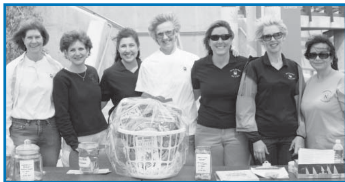
Cheery volunteers, staff and Board members weather a blustery day at Springs Preserve to share the work of Kids to Kids.

In March, Kids to Kids participated in Community Pride Day at Las Vegas Springs Preserve. Dedicated volunteers were on hand to spread the word about the effort to bring books to at-risk children. Special thanks go out to Channel 8 for making Kids to Kids a Community Partner, and for giving broad exposure for our organization and its important work.