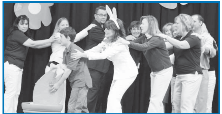
A skit illustrates that literacy takes a community.